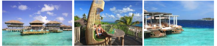
Longitude / Leaf / Chill Bar