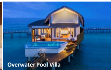
Overwater Pool Villa