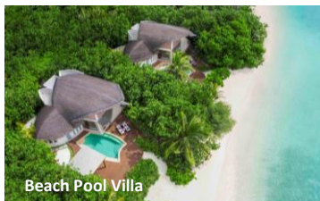
Beach Pool Villa