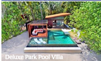
Deluxe Park Pool Villa

酒店位於馬列市以南 400 公里的天然環狀珊瑚島 North Huvadho Atoll 周圍環繞 150 多個天然、未經開發的島嶼和 10 個有當地人居住的島嶼。 50 間別墅以木材及石材為裝潢特色，面積至少有 1000 呎，均設有私人陽台； 設有 2 間餐廳及 1 間酒吧，PADI 五星級潛水中心、無邊泳池及靜謐游泳池。