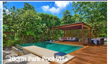
2Bdrm Park Pool Villa