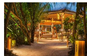
Signature Restaurant - Island Grill