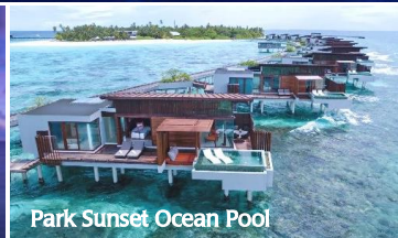
Park Sunset Ocean Pool