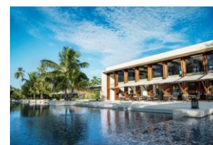
Main Restaurant - The Dining Room