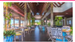
The Edge, All Day Dining

NOT included: certain menu items, in-villa dining, special island dining, premium pouring brand and any inclusion not stated above.