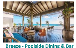
Breeze - Poolside Dining & Bar